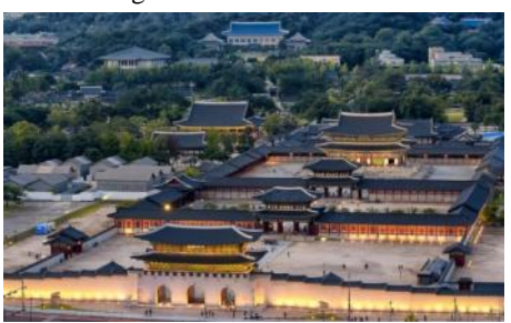
Old palace, traditional figures