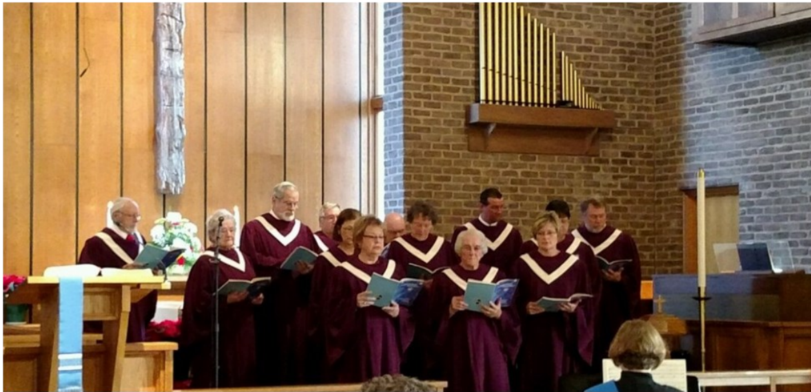
Mini Cantata by our