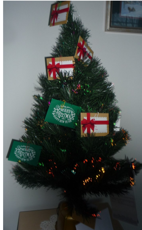
Walmart gift cards for Valley Mission