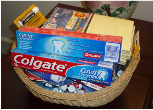
Donations of toothpaste, chap stick, and junior legal pads for King's Way prison ministry