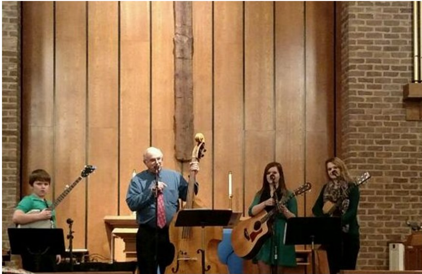
Cousins 4 Christ entertained us following the Christmas Dinner