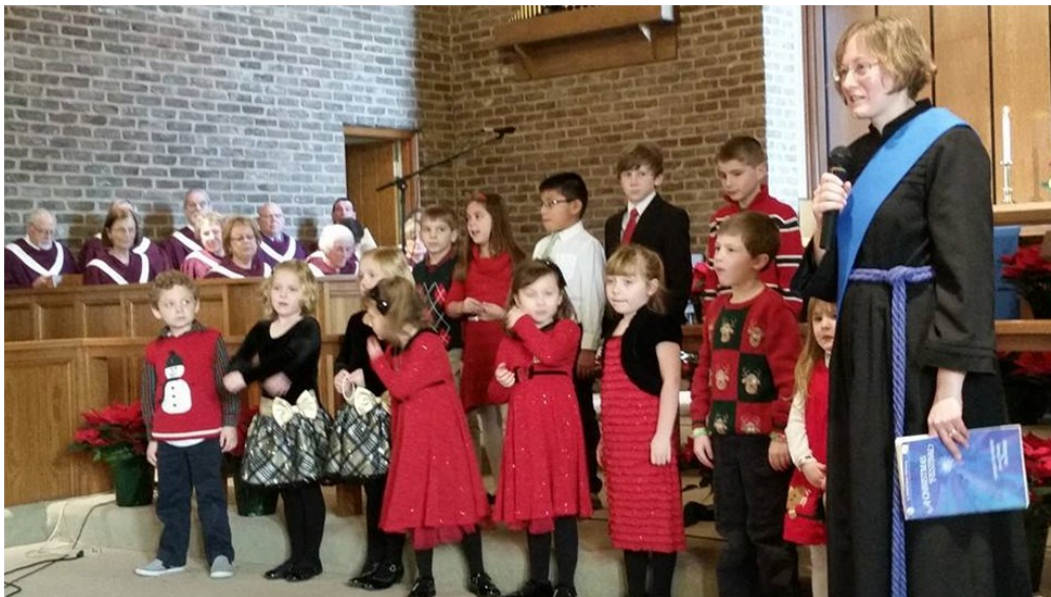
Children's Christmas presentation